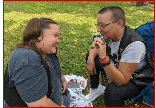
Click here to watch the video

Cigar lounges the world over are filled with people of disparate backgrounds and opinions, but their passion for cigars transcends politics and other barriers that would otherwise separate them. Among these enthusiasts are a significant number of Leatherfolx who continue to add to the long history of cigar smoking within the Leather community. As an activity that simultaneously celebrates the individual and creates a kinship centered on this passion, cigars serve several functions for us. They are a hobby, a fetish, a tool for play, and confer status upon those who are knowledgeable about them and skilled in their uses. In this video which showcased at BV Online 2020, Fred gives us an introduction to the world of cigars; and Sir Badge, Alice, and Rebel show us some of the fun to be had with cigar service. Enjoy!