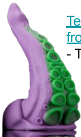
Tentacle dildo from Bad Dragon - Thumper