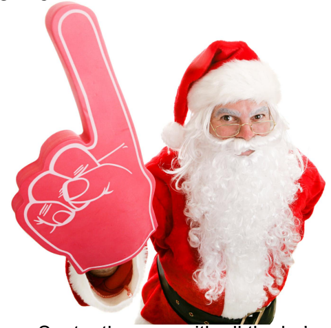
Santa, the man with all the ho’s

For almost all of us, the limits of fisting are two hands and ten fingers. This is really a shame if you think about it. Imagine, you’re in the moment, all is going well, every zig is met with a perfect zag, all of your fingers, palms, and wrists are occupied, and THEN your person is encouraging, nay DEMANDING, more.