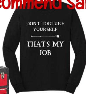
Portable Toolbox for Bootblack Kit - KinkyIrishCowboy