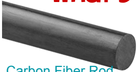
Carbon Fiber Rod for Misery Sticks - Absolem